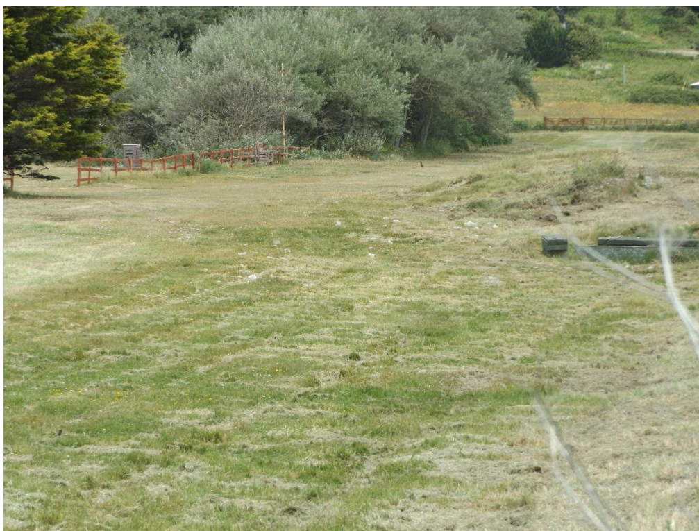
A view of Follain Field

The Westward Ho Campsite consists of 8 large, mostly flat, pitches on two large fields.